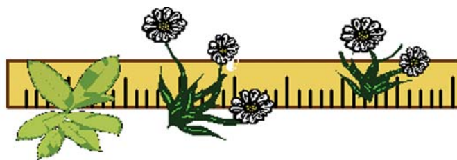
Figure 1. For more information on the line intercept method, consult the Sampling Vegetation Attributes manual available at: http://www.blm.gov/nstc/library/pdf/samplveg.pdf .

less affected by seasonal growth patterns than is canopy cover, so time of year has less effect on measures. Canopy cover is especially useful for monitoring shrubs and clumped vegetation like bunchgrasses. For example, a goal in rehabilitating a bunchgrass stand may be to increase perennial grass basal area to 10% within five years. This can be assessed each year by randomly establishing a group of 10 to 20 line transects in the management unit. The length of line that crosses grass bases is recorded and the percentage basal area calculated by dividing this intercepted distance by the line length (Figure 1). If 20 inches of a 1,200-inch-long line cross over plant bases, basal area for that transect would be 20/1,200 = 2\% .