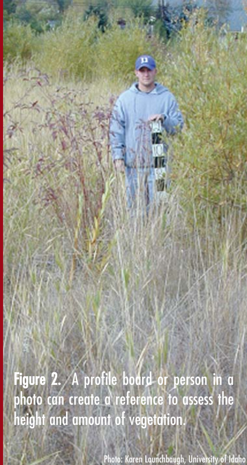
Figure 2. A profile board or person in a photo can create a reference to assess the height and amount of vegetation.